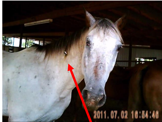
Metal clip in mane

In another pen, three thin stallions were observed. They were very agitated, kicking and scratching the pen floor. Investigators also noted a thin mule, covered with lumps.