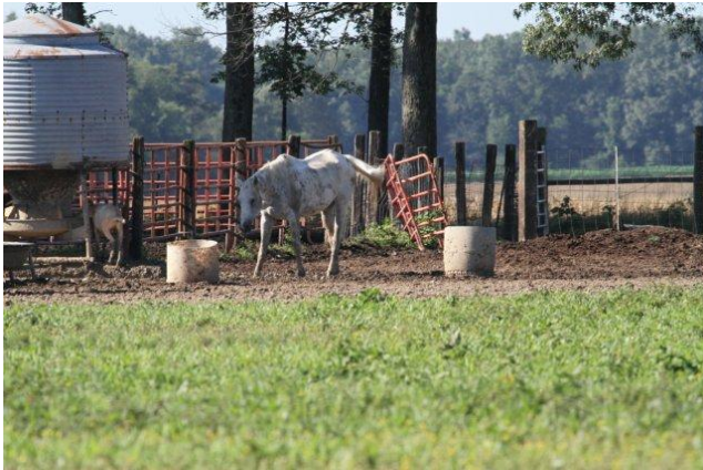
Thin horse with plastic water buckets

The R & R slaughter horse collecting station operated by Randy Ray, who is also on the “ Commercial Transport of Equines to Slaughter ” violators list. According to documents obtained from the USDA, R & R livestock provides horses for kill buyer Jeron Gold in Michigan. The large property has extensive pastures, a trailer home and a barn with a wooden loading ramp next to it.