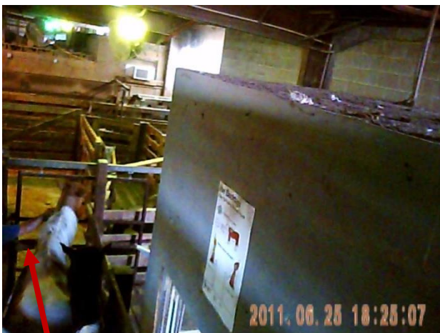
Ryan drawing blood

All horses and other equidae, except un-weaned foals accompanied by their dam, offered for sale, traded, given away, leased, or moved for the purpose of change of ownership shall be negative to an AGID test or other USDA approved test for equine infectious anemia within the previous twelve (12) months. Equine which are offered for sale at approved auction markets without proof of a negative test for EIA within the previous twelve (12) months shall have a blood sample drawn at the market by the approved market veterinarian at the seller's expense.