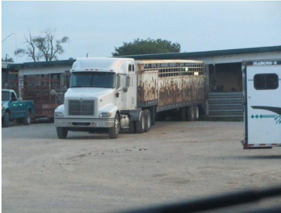
R & R Livestock

The parking lot was crowded with pick up trucks and large stock trailers. Several kill buyers were present and ready to buy. Ryan, who appears to manage the sale, had brought his large stock trailer. R & R livestock arrived with a semi and single deck trailer at 5:18pm, backed up to the loading dock and unloaded a few resale horses. The truck & trailer of William Middleton was parked in front of the barn.