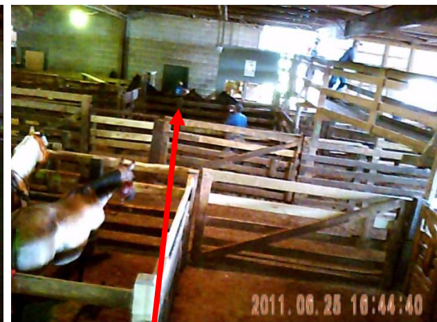
Chute used to restrain horses